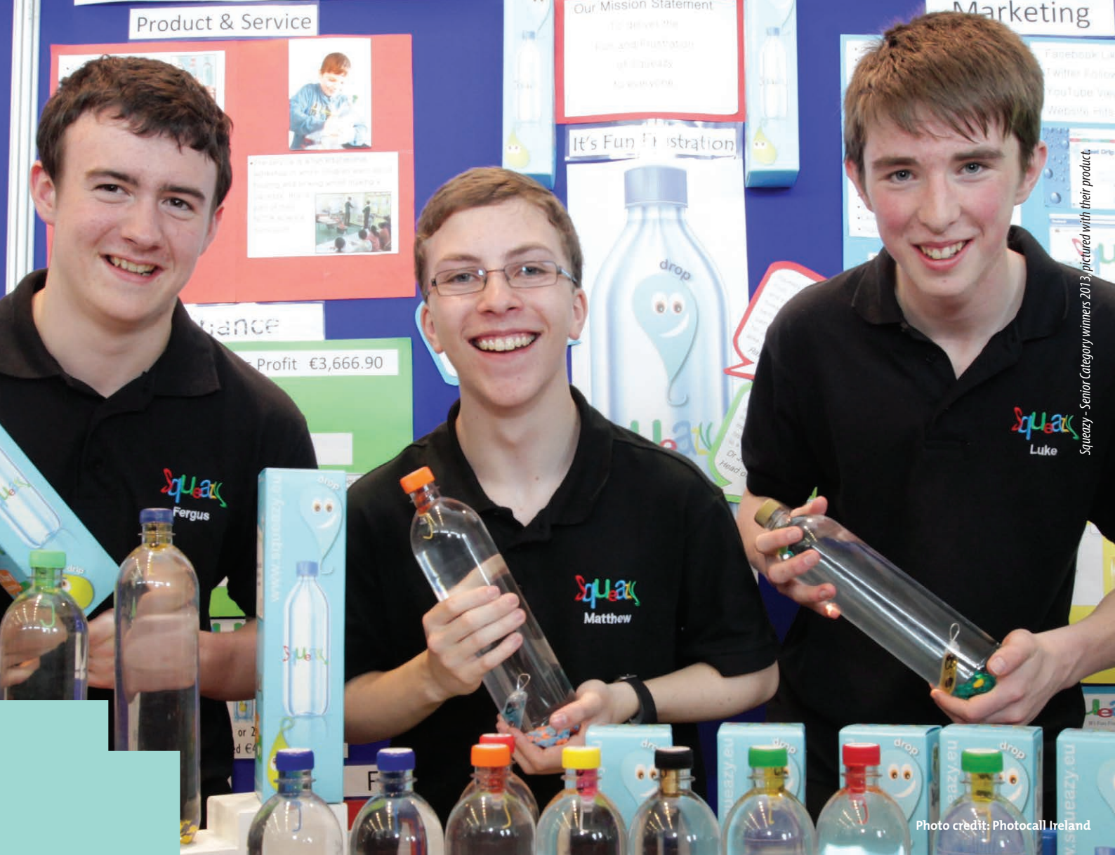
Squax - Senior Category winners 2013, pictured with their product.